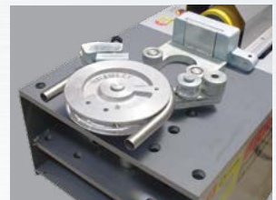
Model 88-50 Round Tube Bending Attachment