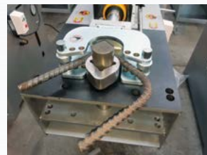
Model 88-80 Rebar Bending Attachment