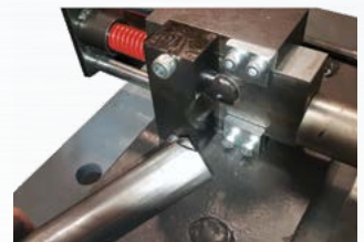
Model 88-90 Pipe Notcher Attachment