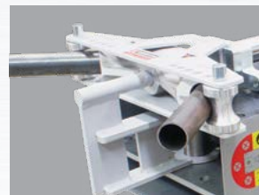
Model 88-70 Pipe Bender Attachment